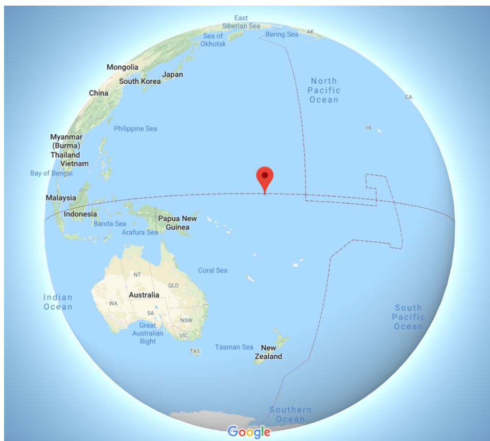
Figure 2 Google Map of the Pacific Highlighting the Location of Banaba in Kiribati.

Prolonged sitting, writing, reading, rewriting, and editing are static embodied processes unnatural to human design. And while I'm so pleased the book has been taken up in several anthropology, history, Pacific studies, and Indigenous studies classrooms, the chapter I love most is the one that reviewers and editors had almost nothing to say about. Titled "Remix: Our Sea of Phosphate," it consists of textual and visual fragments from books, journal articles, ethnographic film, and archives. 2 Elsewhere, I have written about my interest in Indigenous remix and how apt it is for Banaban lands, choreographies, histories, and displacement. 3 My goal has never been to produce a neat and well-synthesized master narrative of what happened to Banaba, also known as Ocean Island, but to appropriately present our two-and-a-half-square-mile (six-square-kilometer) ancestral island that was broken, crushed, dried, bagged, and hauled off in ships "in pieces." The remixed forms of research and storytelling about Banaba are in line with the multisited, multisensory, empirical, material, social, and political elements marking the interaction and mutual interference between Banaba and twentieth-century British, Australian, and New Zealand colonial, imperial, agricultural, and food security projects.