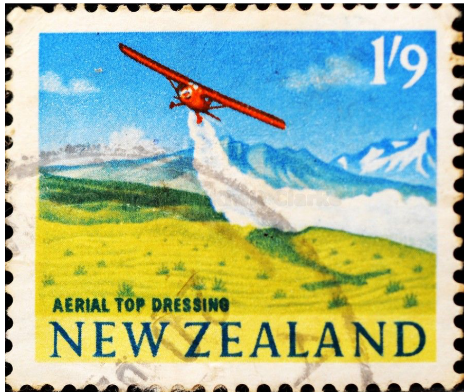
Figure 5 Aerial Top-Dressing Stamp , circa 1960. New Zealand Post Museum Collection, artwork by J.C. Boyd, produced by Harrison & Sons Ltd.

and our ancestors are part of those rocks. So spreading Banaba across Aotearoa is, as the Māori curator, Te Hira Henderson, proclaimed at the opening of Project Banaba , one of the most shameful things he's ever heard of, the worst thing you can do to Indigenous people—take their bones and spread them across other people's lands and eat them. This iconic image of a New Zealand crop duster spreading Banaban and Nauruan phosphate fertilizer across hill country was a key motif that I replicated throughout the show.