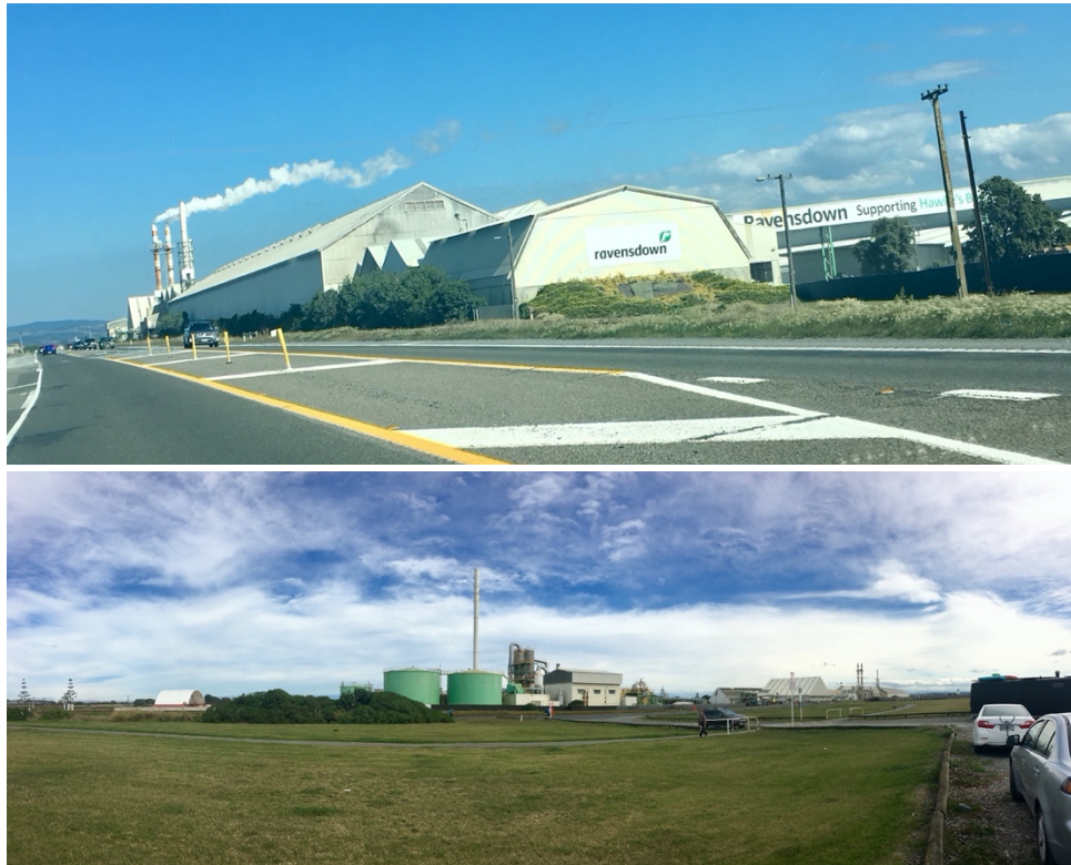
Figure 4 Ravensdown at Hawke's Bay, Aotearoa New Zealand.

history. He said that aside from employees most people in the region had no idea of the global and historical implications of activities at the plant. Most people did not realize that New Zealand had been consuming Nauruan and Banaban phosphate for decades, multiplying their agricultural outputs while also polluting both Pacific and New Zealand environments, and displacing the Banabans.