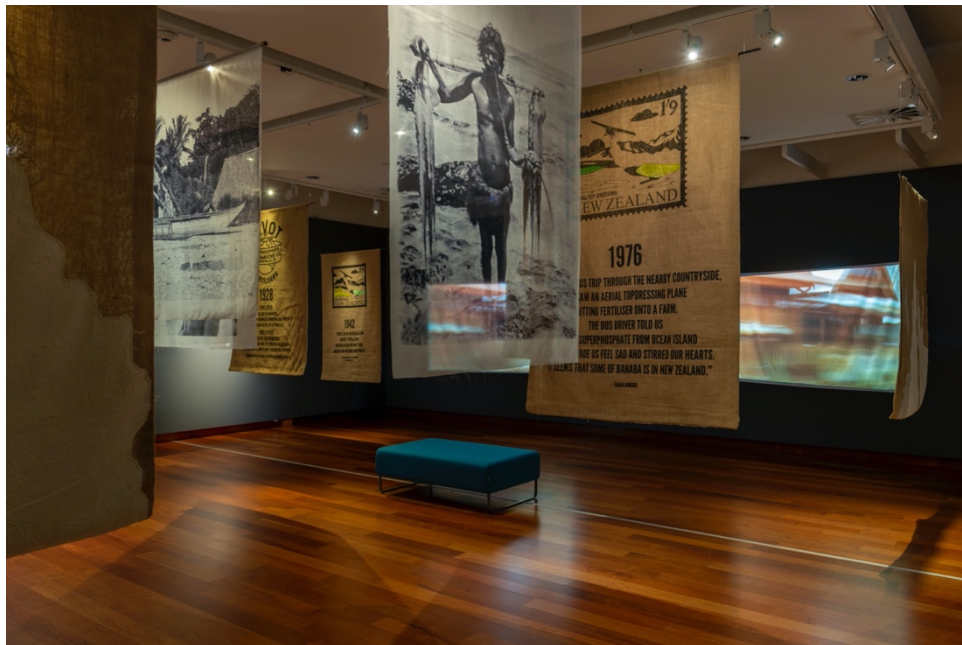
Figure 6 Project Banaba at MTG Hawke's Bay Tai Aburiri, 2019. This view shows textile work that was added to Project Banaba when it traveled to Aotearoa New Zealand. Land from the Sky deconstructs the 1960 top-dressing stamp and brings it into conversation with Banaban voices and queries about where their land has gone.

spread colonialism and slavery; it is a story of how people treat the environment and how people treat each other.” 5 The stories of Banaba, now mostly buried in archives, farmlands, people’s memories, Facebook groups, and academic texts, can continue as cautionary tales of social and environmental devastation and injustice for the wider world through mediums such as public art exhibitions.